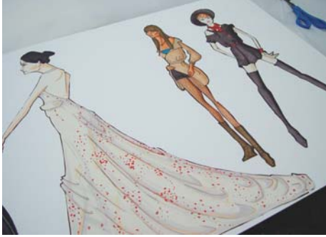
FIGURE DRAWING (NON-NUDE) NEW Teen

In this class, students will draw from a model clothed in a swimsuit. For a further description of this course, see below. Prerequisite: Drawing Fundamentals recommended.